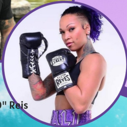
Kali "KO" Reis